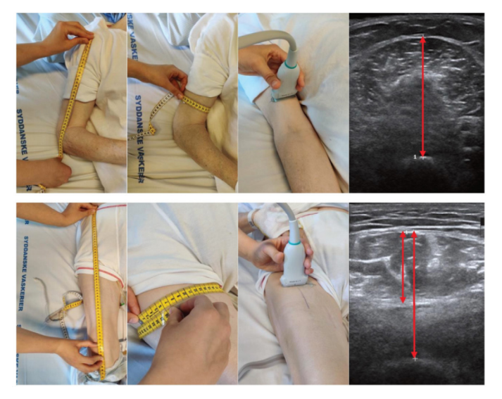
Figure 1. Qualitative and quantitative muscle measurements. The two scanning sites (dominant upper arm and thigh) and the anthropometric measures are demonstrated. UL measurements are shown together with the scanning sites and muscle thickness from the upper muscle fascicle to humerus (biceps) and femur (rectus femoris) are marked with a red arrow. The same applies to the muscle thickness of rectus femoris measured from the upper fascicle to the lower fascicle

Muscle strength was assessed by HGS (kg) using a Smedley dynamometer (TTM; Tokyo, Japan). The width of the handle was adjusted to fit the individual hand size, and HGS was measured using the dominant hand with the elbow in a 90°